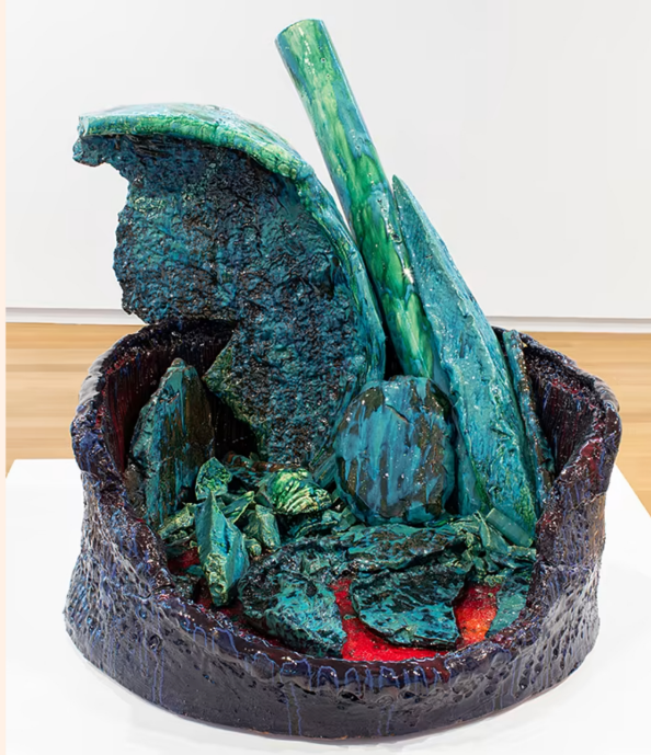
'Basin Theology/Pentredrone' (2014) by Sterling Ruby