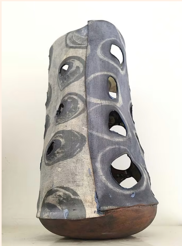
‘Pupis’ (2018) by Ranti Bam

So why the art world vogue for ceramic work previously designated as “craft”? A cynical view might be that galleries, in their ever-expanding state, need to throw the net wider in order to fill their inventory: the proliferation of fairs and the super-sized galleries on four continents necessitate a lot of stock.