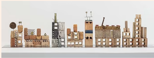
‘Il Canal Grande (The Grand Canal)’ (1963) by Fausto Melotti © Hauser & Wirth

At Art Basel Miami Beach other showings include sculptures by Kahlil Robert Irving at Callicoon Fine Arts — whose accretions of slip-cast soda bottles and fast food containers, newspaper clippings and lottery tickets speak of African-American misery in the decaying Rust Belt — and Pia Camil’s refashioned traditional masks at Bogota’s Instituto de Visión.