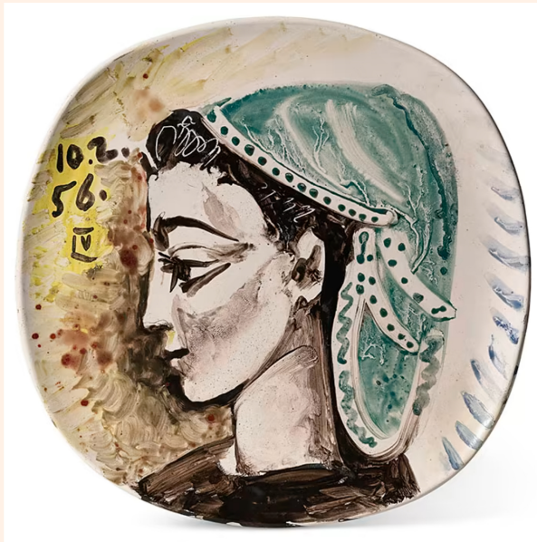
'Portrait de Jacqueline' (1956) by Picasso

The two fundamental factors, then, are audience and value. The art-buying public has increased, awareness of contemporary practice is higher than ever and tastes are broadening. Meanwhile, the rapidly rising value of some ceramic work makes it more attractive to galleries: you could call it the Picasso effect. Not until this decade were the Spaniard’s ceramic works taken seriously by collectors, but as one of the few ways left to buy into the artist, that has changed.